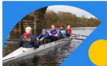
Lancaster & Morecambe u3a rowers have set themselves the challenge of a rowing relay covering a course of 35 miles down the River Lune. The event is just one of the many ways that Lancaster & Morecambe u3a are celebrating their 35th anniversary.